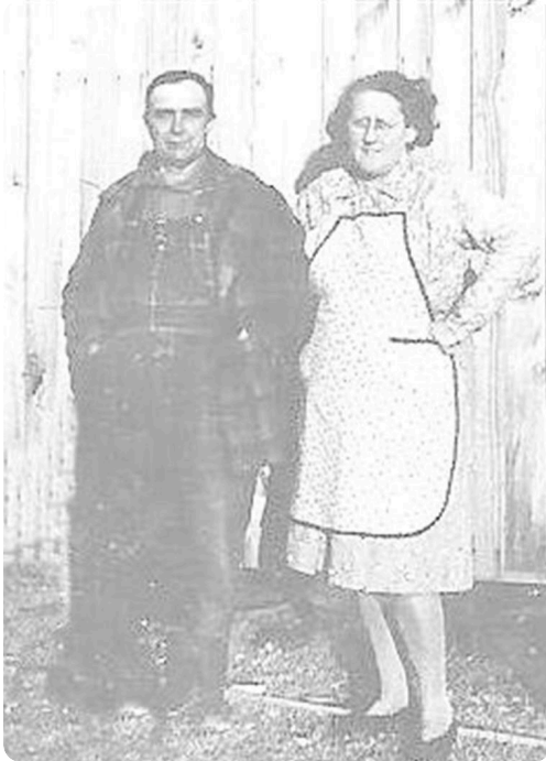
His Mom and Dad