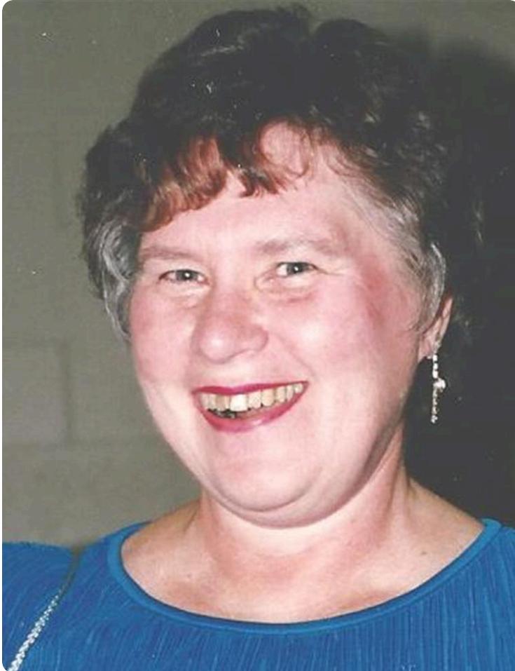
His better half